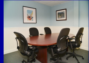
Ben Jordan / Photo Images Co.